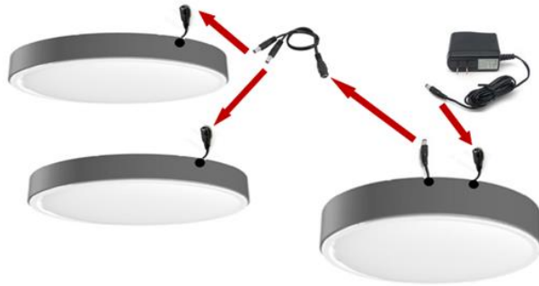
FIG. 3 Kit "MLK-3": 2 Single Color MagicLights™, 1 Master Control MagicLight™