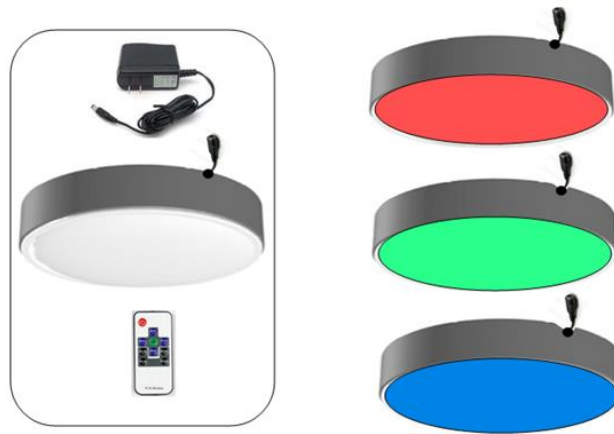
FIG. 4 Kit "MLK-4": 1 Single RGB MagicLight™ with RF Remote